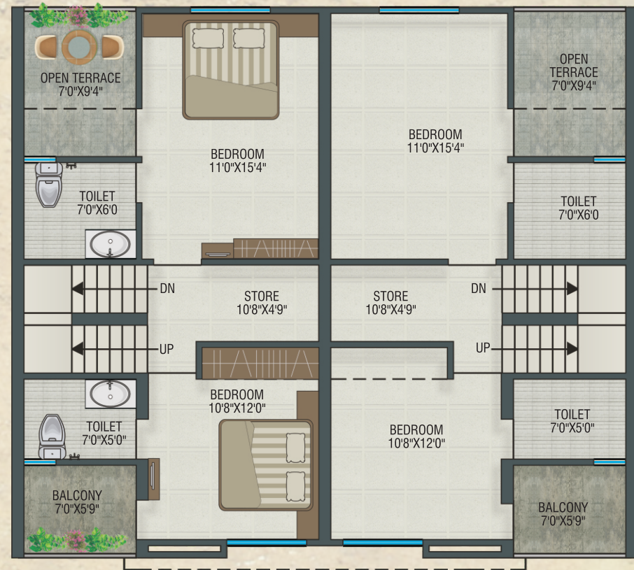
FIRST FLOOR PLAN S.B.A. : 611.00 SQFTS STAIR CABIN S.B.A. : 90.00 SQFTS