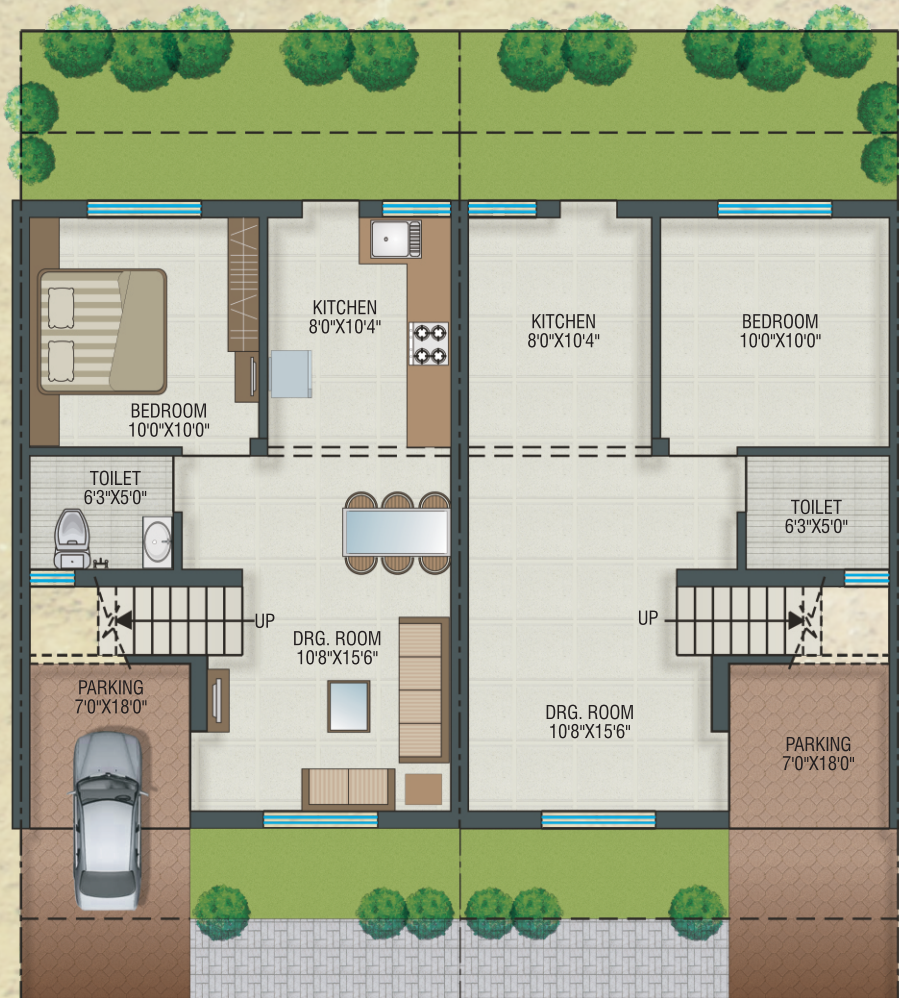
GROUND FLOOR PLAN S.B.A. : 657.00 SQFTS